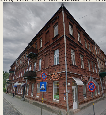
Lāčplēša street 35