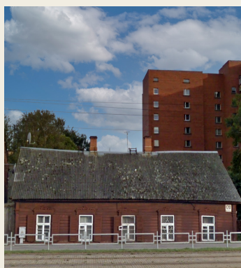
18. novembra street 120

The part of the city called Jaunbūve was very popular with the German population. Not only was the Church Hill nearby, but there were also railway workshops staffed by many Germans living in the area. Those were engineers, car maintenance specialists, guards, technicians, etc. Varšavas Street and the adjoining streets on the side of the Orthodox Church were called the German settlement. The information found testifies that the Germans lived in the houses No. 15, 21, 22, 43. Only two of those houses have survived to the present day.