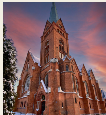
18. novembra street 66

It is believed that before World War II there were very few Germans living in Daugavpils. By providing the information summarized in this booklet, we want to convince the inhabitants and guests of our city that, despite the fact that there were not many Germans (about 500 people) until the autumn of 1939, their presence in the city was quite noticeable. Although almost 100 years have passed since then, we have been able to find out where the Germans lived, what their lifestyle was like, and what their occupations were. For the time being, the information is rather fragmented and has been collected from a variety of sources. We hope that we will be able to continue the work started, gradually creating a more complete picture. This is an offer of a small, unusual tour of Daugavpils, where we will try to tell and show the unofficial life of Germans in Daugavpils shortly before their departure from Latvia.