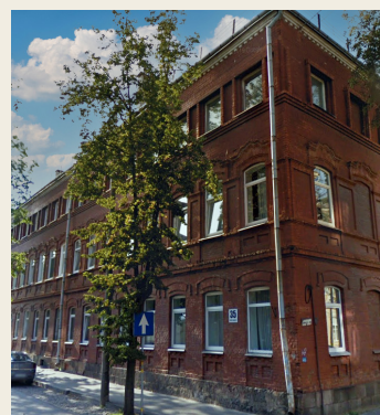
Kr. Valdemāra street 35

The German Parents' Association maintained a German private school (Primary School No. 18) in Daugavpils. Its address was 35 K. Valdemāra Street (3) . The house was rebuilt and has been preserved. The school activities were supported by the entire local German community, therefore for school events the spacious premises of Daugavpils City