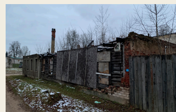
Ventspils street 82