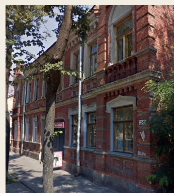
Cietokšņa street 20