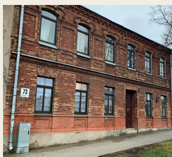
18. novembra street 73

The house No. 73 on 18. Novembra Street still retains the charm of an early 20th century stone building. It is located next to the present Polish Gymnasium.