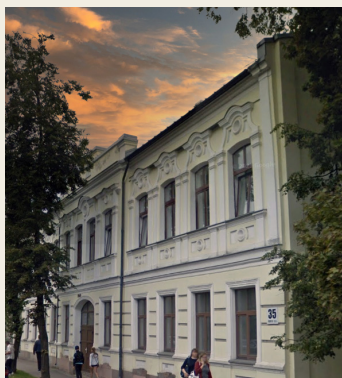
Imantas street 35

Before World War II, more than 500 Germans lived in Daugavpils, which was a little over one percent of the city's total population. This ethnic community had its own meeting places.