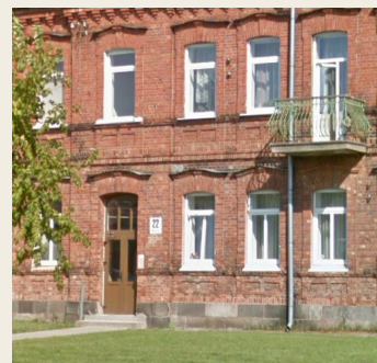
Varšavas street 22

Germans also lived in other parts of our city, for example, on Lielā Dārza St., Vienības St., A. Pumpura St., etc., which confirms their presence in Daugavpils and allows to understand the role and significance of the Germans in the city's life until the autumn of 1939. The Germans were actively involved in trade, sole proprietorships and family businesses. Most often those were families with many children. It was typical of the Germans to live together with older family members. The departure of 300-400 Germans from the city did not pass unnoticed.