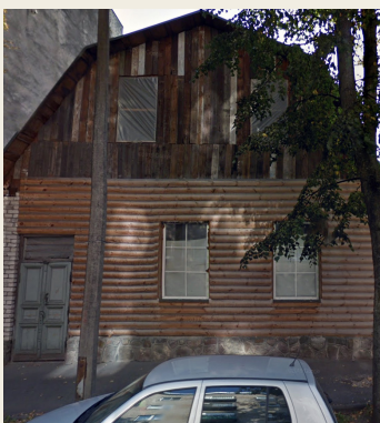
Cietokšņa street 6

Two German families, at least seven people, lived in the 6th house on the same street (6) . One of them was a representative of a beer warehouse and, as was customary at the time, he welcomed guests right at his home. A young man from that German family died near Lviv. The house has been renovated preserving its old foundation.