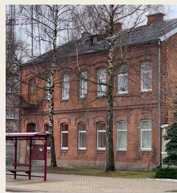
Varšavas street 15

House No 29 on 18. Novembra Street, a three-storey stone building in which the Schnakenburg family lived in one of the apartments.