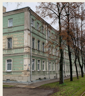
18. novembra street 29