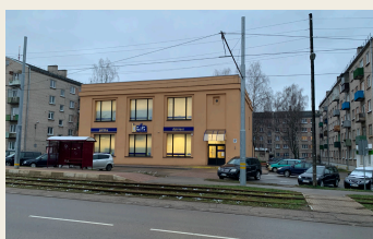
Ventspils street 67/69