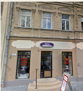
Rīgas street 42

Club at 31 Imantas Street were used. The building of the City Club, rich in tradition, has been rebuilt and preserved.